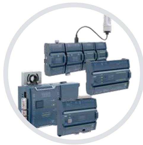
ECLYPSE Controller Series Connected IP and wi-fi product series