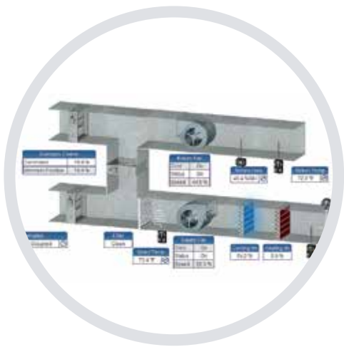
EC-Net Web-based multi-protocol building automation and energy management platform