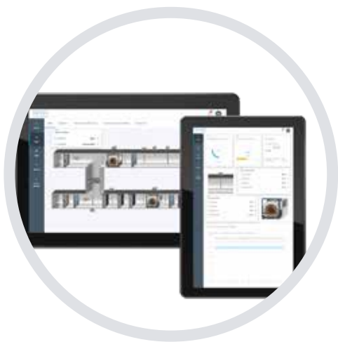
HORIZON-C IP based capacitive multi-touch color display