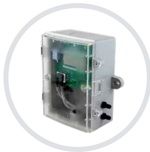
Field Devices Quality, performance-proven, and competitively priced products that work best with our offering